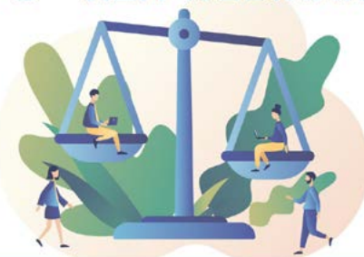
Sustainability, Accountability and Legitimacy of CSOs: Challenges and Good Practices from Korea and Europe